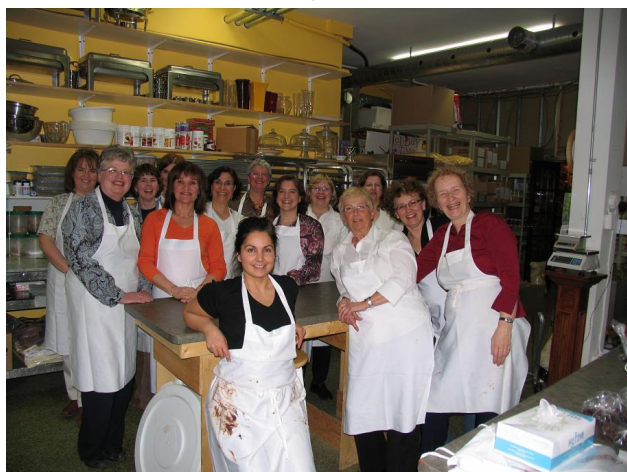
Travail d'équipe en faisant le chocolat, 3 avril