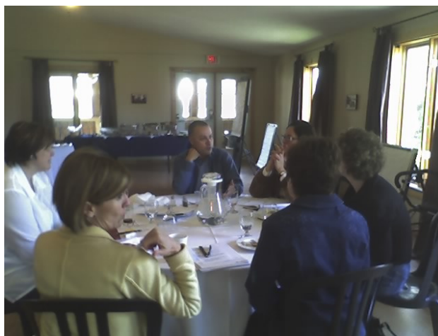
May 4: Faculty enjoying lunch after a morning of strategic planning

D'autres événements qui se sont déroulés au courant de l'année se doivent d'être soulignés sont : la deuxième journée annuelle d'orientation pour les nouveaux professeur(e)s (29 août 2006); le Conseil Ontarien des Études Supérieures (OCGS) a passé en revue les programme d'études supérieures (22-24 janvier 2007); une journée de planification stratégique s'est tenue au Stanley's Old Maple Lane Farm (4 mai 2007); une journée de développement professionnel (16 mai 2007); et la journée de planification de programme d'études (29 mai 2007). Quarante-huit (48) membres de la faculté et professeur(e)s à temps partiel ont participé à la journée de développement professionnel. Soixante (60) membres de la faculté, du personnel en double affectation, des professeurs à temps partiel et de nos partenaires ont participé à la journée de planification stratégique. L'École remercie tous les membres du corps professoral, le personnel en double affectation, les professeurs à temps partiel et des partenaires pour le travail accompli pour l'avancement de l'École. Le processus de planification stratégique a débuté par une analyse de SWOT en février/mars dernier et a continué lors de la journée de planification stratégique en mai. Une ébauche du plan stratégique sera développée au courant de l'été.